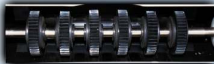
High Tensile Strength Roller