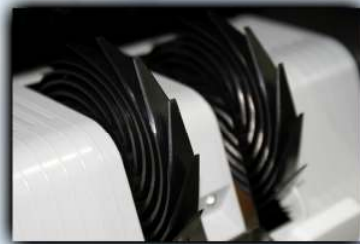
Low Friction Impeller