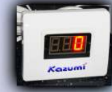
* External Customer Display