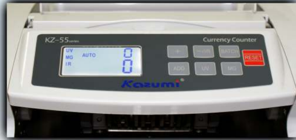
Simple Layout Keypad